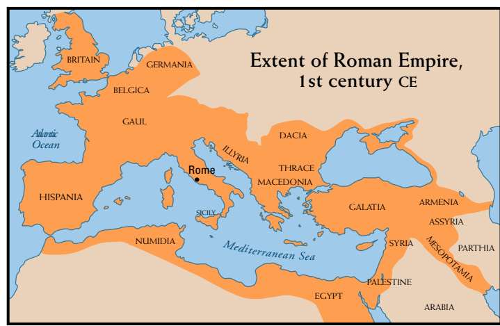
Extent of Roman Empire, 1st century CE

Rome began as a system of small settlements built on hillsides to avoid swamps and flooding. As irrigation and technology improved, the greater city was walled, allowing residents to live in relative security from both floods and invaders. The Republican period, marked by the rule of elected consuls and the advisory Senate, began in about 500 BCE. Imperial Rome, under the rule of emperors beginning with Augustus Caesar around 27 BCE, continued into the 5th century CE, but its influence and strength had begun to wane well before the year 200.